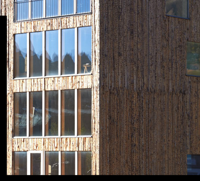
MIXED-USE, BERN, SWITZERLAND